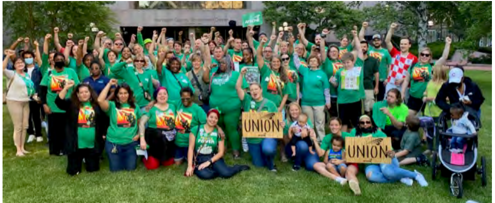
Hennepin County AFSCME Members Meet to Kick Off Contract Negotiations!