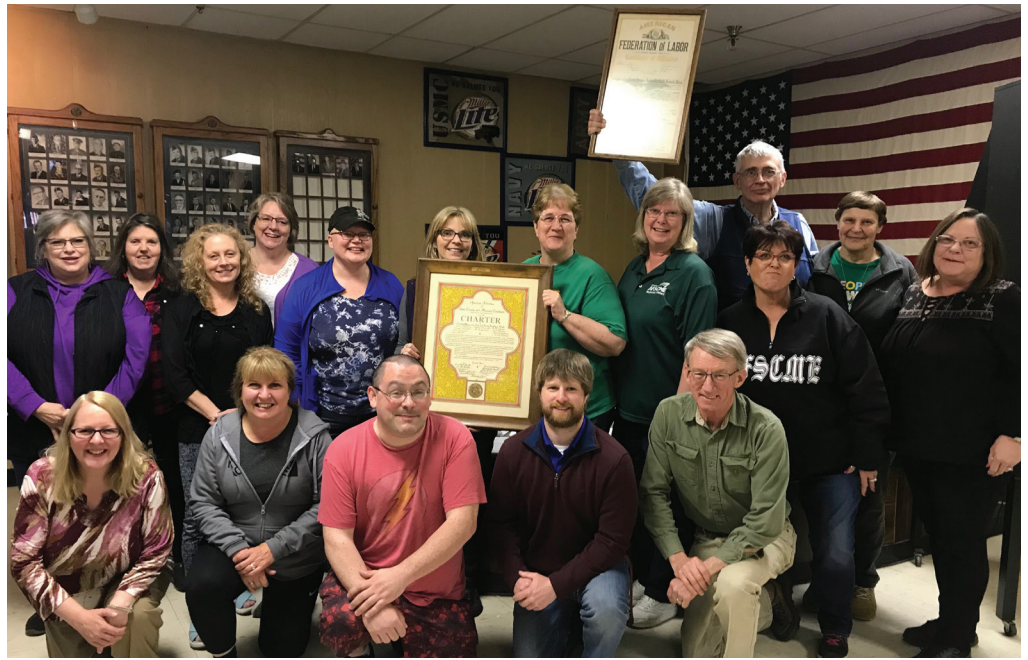
Local 66 members celebrate their union's 100th anniversary at the Servicemen's Club in Virginia, Minnesota.