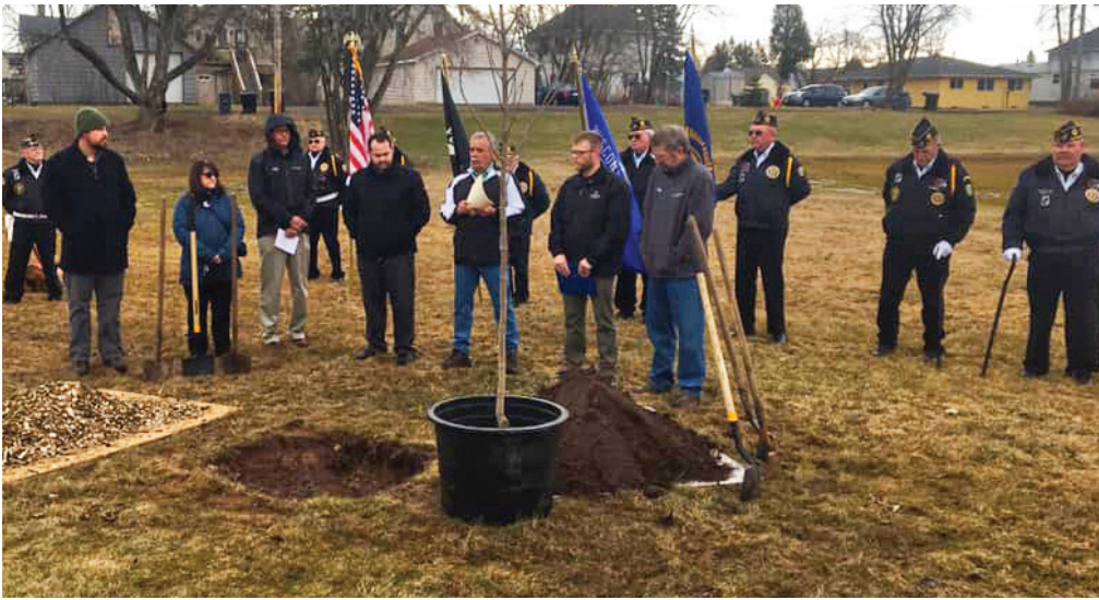
This page, clockwise from top: workers plant a tree in honor of those killed on the job this year - the ceremony takes place every year at the Duluth Labor Temple; Apple Valley Color Guard pays tribute to fallen workers; hundreds of workers - including dozens of AFSCME MnDOT and corrections workers - gather at the Workers Memorial Day service in Rochester; workers enjoy a solidarity pancake breakfast.