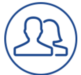
Family of AFSCME Members

Learn more at freecollege.afscme.org or call 888-590-9009