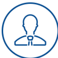
Retired AFSCME Members