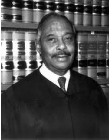
Federal judge Jack Tanner ruled in 1983 that the state was guilty of “institutionalized discrimination” against employees. The state appealed Tanner’s decision. U.S. District Court

to reflect the marketplace. What’s more, the state’s good intentions were evident in its “active, successful affirmative action program” for women in state jobs.