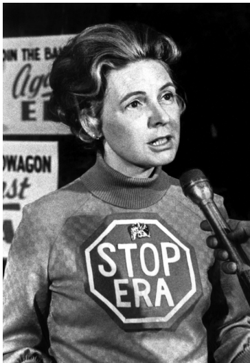
Phyllis Schlafly, a leading opponent of the equal rights amendment, saw comparable worth as "a new rallying point against the ERA."