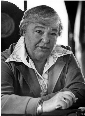
Governor Dixy Lee Ray said comparable worth was like mixing “apples with pumpkins and a can of worms.”

do before he left office. In his proposed budget for 1977, Evans included $7 million to begin implementing comparable worth. He hoped it would be gradually carried out so it wouldn't prove disruptive to state budget-writing.