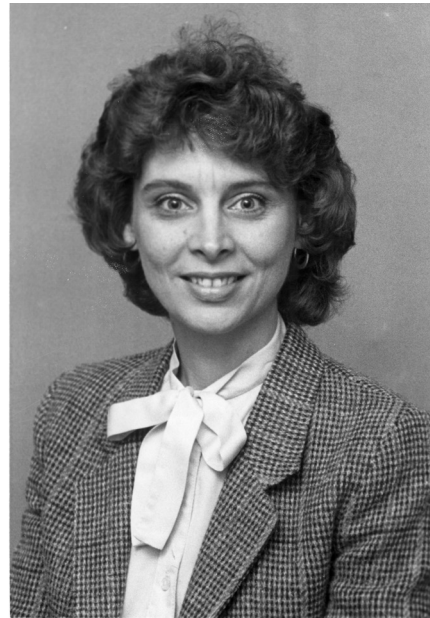
Former Governor Chris Gregoire, the state's first female deputy attorney general, felt "constant mixed emotions" about her role in the comparable worth case.

The lawsuit was rooted in an innovative argument. Union attorneys said employers needed to go beyond the existing doctrine of "equal pay for equal work." That 1963 law rarely applied because men and women didn't often perform the same work. They were segregated by occupation. Engineers were men, nurses were women; same with plumbers, librarians and more. The idea unveiled in Washington was called "comparable worth." It hung on the notion that jobs of similar value to an employer should be paid the same.