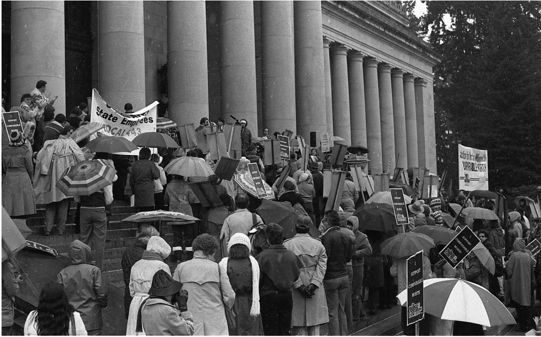
At the time of the union lawsuit, more than 100 state employees—mostly women—were paid so little they received welfare checks.

She became a leading spokeswoman for the cause. “Through the union, I’ve learned how to fight back, stand up for my rights, get things done and help other people. But I could never have done it without my husband’s support.”