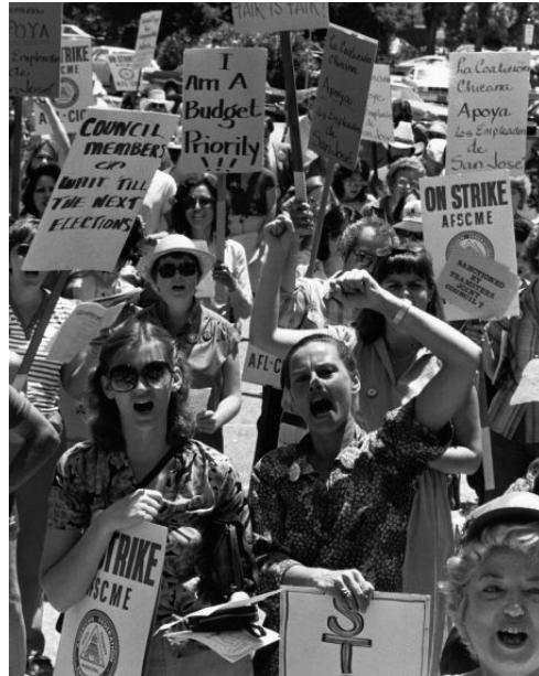
Comparable-worth campaigns surfaced beyond Washington's borders. AFSCME members in San Jose, Calif. won pay adjustments after going on strike in 1981.

For most of those 140 activists, Washington was the catalyst. "It all of a