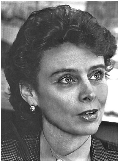
Booth Gardner said Gregoire's work on comparable worth led him to appoint her head of the Department of Ecology.