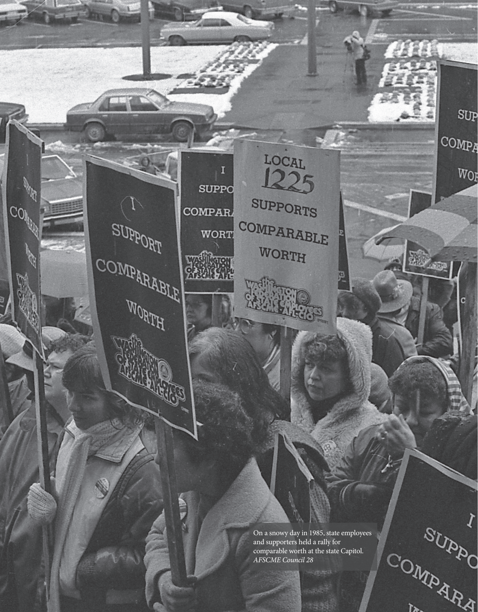
On a snowy day in 1985, state employees and supporters held a rally for comparable worth at the state Capitol. AFSCME Council 28