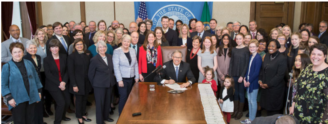
In 2018, Washington adopted one of the country's strongest pay-equity laws when Governor Inslee signed HB 1506. Washington State House Democrats

As solutions, the Task Force suggested policies that would expand protections for workers who share salary information, as well as those that would revive principles of comparable worth. But bills featuring those policies languished in the GOP-controlled Congress in recent years.