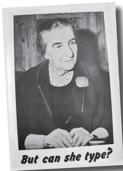
The Seattle-King County chapter of NOW created a famous poster of Israeli Prime Minister Golda Meir.

The traffic guide's pay was slightly higher, although