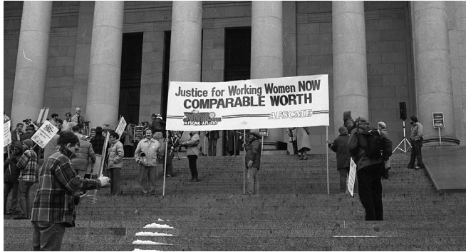
Some men also stood to benefit from comparable worth if data showed they were underpaid in their positions. AFSCME Council 28

EVEN SOME LOCAL PROPONENTS said comparable worth was losing ground. "Those who used to be in the middle of the road are now skeptics. And those who