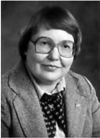
Eleanor Lee, a Republican state senator, was an outspoken supporter of comparable worth.

because it would leave Kennedy's 9th Circuit ruling untouched and the law of the land.