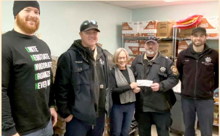
In Galesburg, Local 1274 members from the Henry Hill Correctional Center donated $2,000 to the local food pantry.