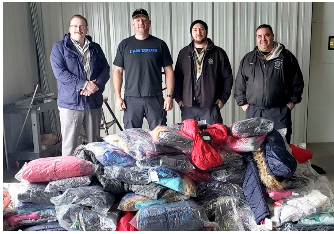
Local 46 members from the East Moline Correctional Center surprised the school district with a large donation of winter gear.

AFSCME members come together to aid those in need