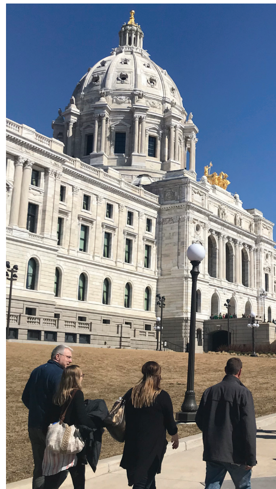
Left: Corrections Lobby Day 2019 Above: Day on the Hill 2019